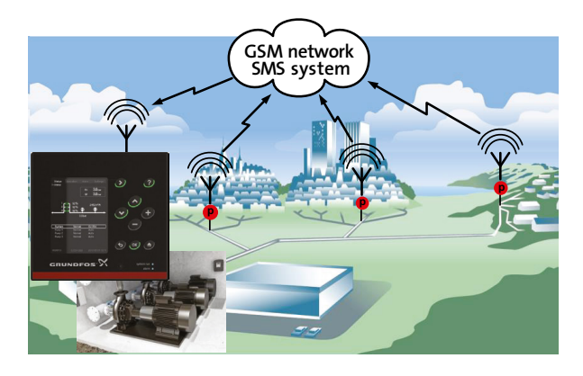
Figure 5: The Demand Driven Distribution controller connected to network pressure sensors via the GSM network allows control of the pumps in accordance with the logger data via a smart adaptive control algorithm

Demand Driven Distribution measures the pressure in the network using a number of battery-driven data loggers that transmit the measured and logged values to the Demand Driven Distribution controller via the GSM network, using just one SMS text message pr. sensor a day. The measured data are then used in a smart adaptive control approach that controls the pumping station, keeping the pressure in the network at the desired value, without troublesome analysis and re-configurations of the system to obtain proper operation.