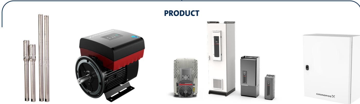
SQFlex submersible pump